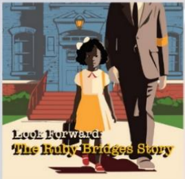
January 17 - 26, 2025